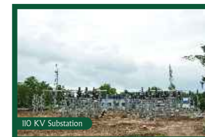
110 KV Substation

Food Court, Conference Hall, Training Hall, Bank, ATM etc.. Power Back-Up: 1010 KVA 2 nos. Diesel Generator providing 100% power back up Status: Ready for fit-out