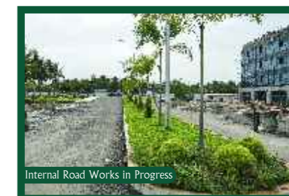
Internal Road Works in Progress