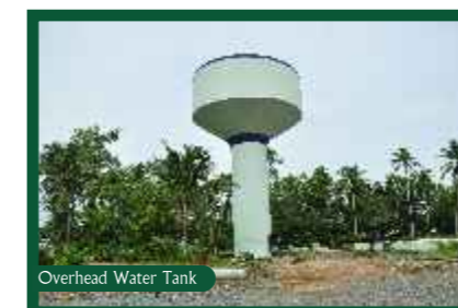
Overhead Water Tank