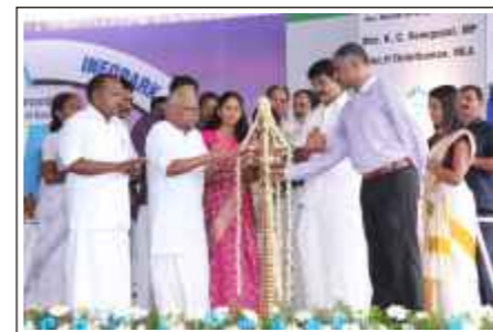
Infopark Cherthala : Inauguration of the First IT Building by the Hon'ble. Chief Minister Shri. V. S. Achuthanandan on 9th January 2011 at Infopark Cherthala, Pallippuram.