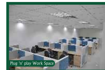
Plug 'n' play Work Space