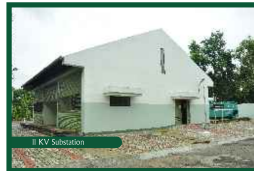
11 KV Substation