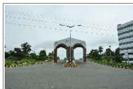
The newly constructed 2.3 kilometer 4 lane Expressway connecting Infopark to the Airport-Seaport Road. Inaugurated by the Hon'ble. Chief Minister Shri. V. S. Achuthanandan on 27th June 2010.