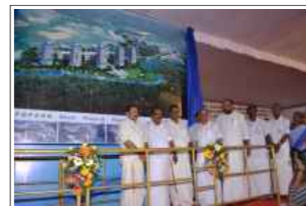
INFOPARK KOCHI PHASE II: Master Plan unveiling of Infopark Phase II and the Foundation stone laying ceremony of the First IT Block by the Hon'ble. Chief Minister, Shri. V. S. Achuthanandan on 20th Feb-2011, presided by the Hon'ble Minister for Fisheries and Registration Shri. S. Sharma.