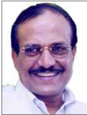
Shri. P. K. Kunhalikutty Hon'ble Minister for Industries, Information Technology and Urban Affairs, State of Kerala & Chairman, General Body, Infoparks-Kerala

The achievements that Kerala has made in the field of Information Technology are astounding. Over the years, our people have grown accustomed to the unprecedented growth of IT in every nook and corner of the State. Today, the world recognizes Kerala as an IT hotspot, as has been evinced by the entry of global and national IT players of high repute, in the IT scenario of Kerala.