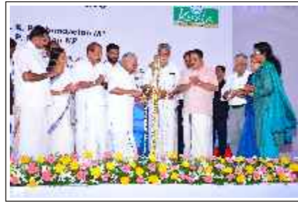
Infopark Thrissur : Inauguration of Phase II IT Building, Foodcourt and substation by the Hon'ble. Chief Minister Shri. V. S. Achuthanandan on 8th January 2011 at Infopark Thrissur, Koratty.