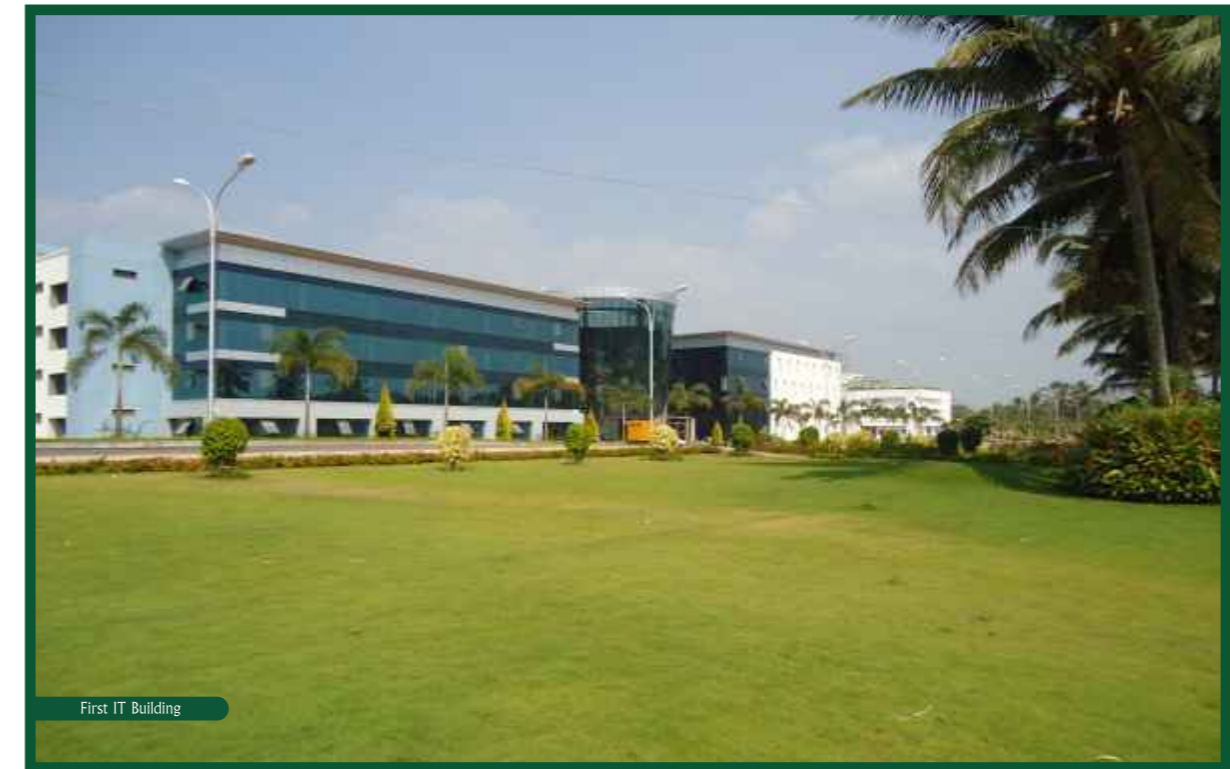
First IT Building