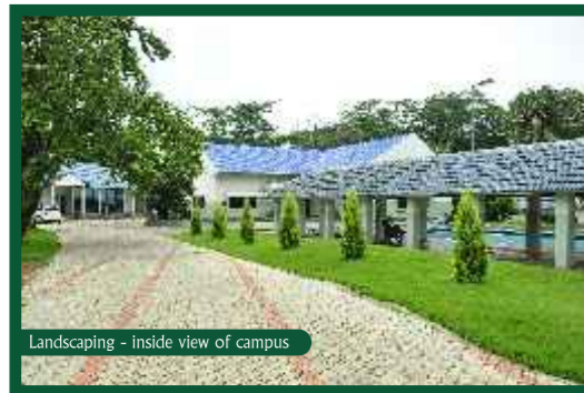
Landscaping - inside view of campus